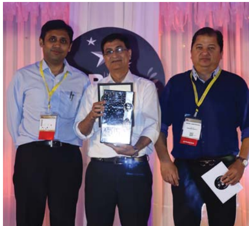
IMAGES MOST ADMIRED RETAILER OF THE YEAR FOOD & GROCERY