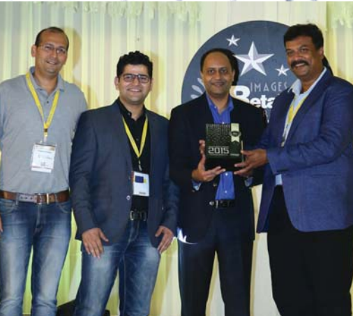
IMAGES MOST ADMIRED RETAILER OF THE YEAR MARKETING & PROMOTIONS