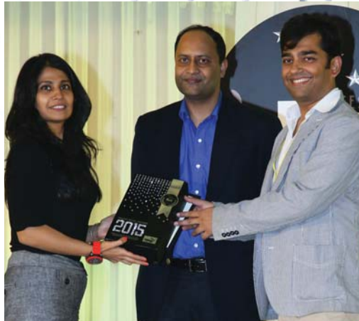
IMAGES MOST ADMIRED RETAILER OF THE YEAR MARKETING & PROMOTIONS