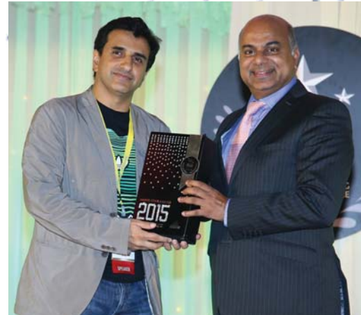
IMAGES MOST ADMIRED RETAILER OF THE YEAR STORE VM