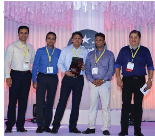
IMAGES MOST ADMIRED RETAILER OF THE YEAR FOODSERVICE