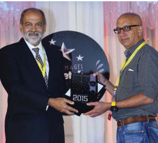
IMAGES MOST ADMIRED RETAILER OF THE YEAR JEWELLERY